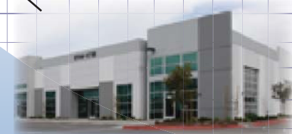
Oceanside Gateway Business Park