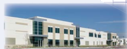
Seagate Corporate Center

Pacific Coast Business Park, 124 Acres Biotech, R&D, & Manufacturing Seagate Corporate Center Ocean Ranch Corporate Centre Oceanside Gateway Business Park Perfect for Southern California Expansion