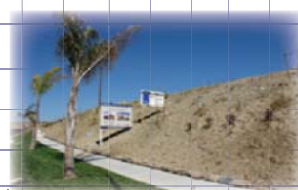
Pacific Coast Business Park