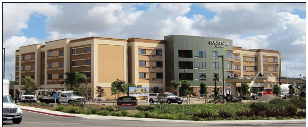
Courtyards by Marriot

The City of Oceanside has just launched a new website with a fresh new look with the emphasis on providing easy access to information important to businesses, visitors and residents. The user now has access to finding information quickly through a new search engine and with enhanced interactive features to City services such as: zoning information, applying for permits, business license information, online payment services, meeting advisories, legal notices, calendars, and the ability to submit forms, etc. Visit the new site at: www.ci.oceanside.ca.us