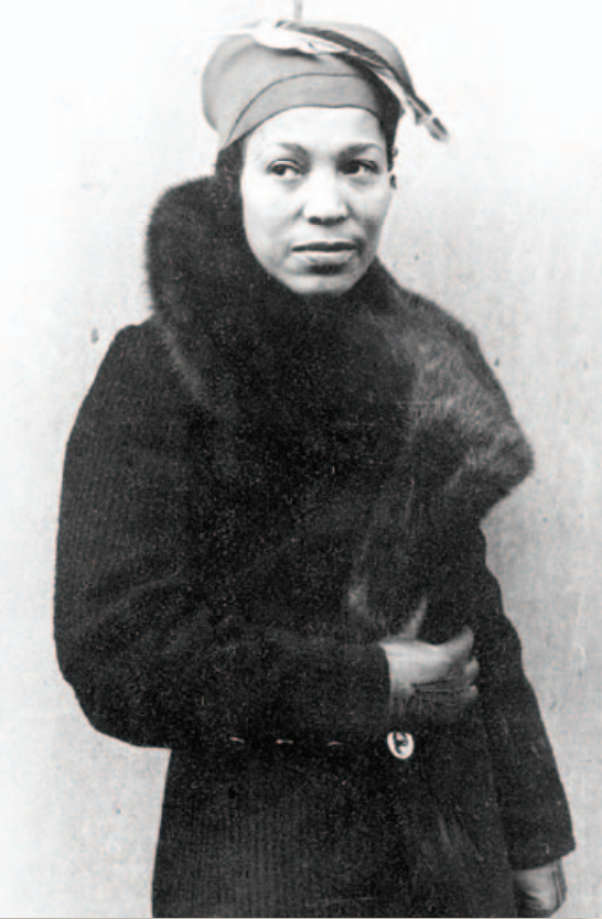
Photograph of Zora Neale Hurston by Carl Van Vechten, November 9, 1934.