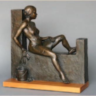
Just A Minute © 1999 Medium: Bronze with wood base Dimensions: 15” x 14-1/2” x 6” One more window to wash – in just a minute A knock at the door – wait just a minute A child yells – please, just a minute A pot boils – ok, ok, just a minute Time to rest – for just a minute Time to think – only for just a minute

Based on Alice Walker’s Pulitzer Prize winning story about the life and trials of an African American woman in the early 1900s. (Rated PG-13; run time 154 minutes.)