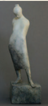
Verity 1 © 2007 Medium: Bronze Dimensions: 11-1/2” x 3” x 3” Coy Innocent Cautiously investigating The truth of youth