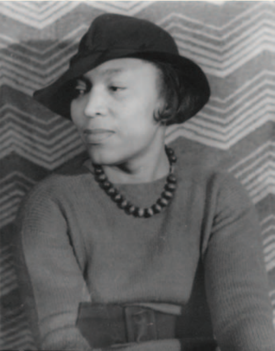
Photograph of Zora Neale Hurston by Carl Van Vechten, April 3, 1935. Used with permission of the Van Vechten Trust. Yale Collection of American Literature, Beinecke Rare Book and Manuscript Library.

A community-wide free series of special programs and events based on