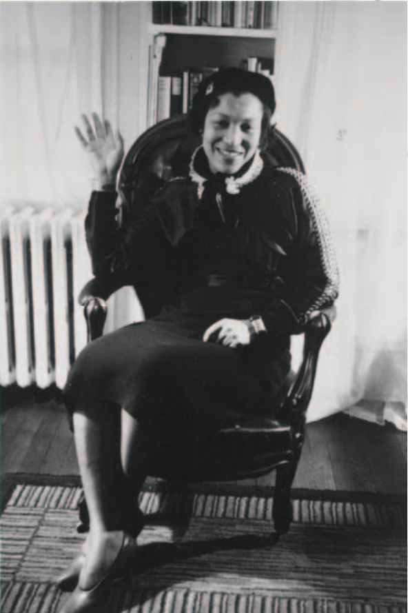
Photograph of Zora Neale Hurston

Sunshine Brooks Theatre, 217 North Coast Highway An introduction to The Big Read project, book giveaways, readings from Their Eyes Were Watching God , and live music from the Harlem Renaissance provided by radio station KSDS Jazz 88.3, with performances from the Black Storytellers of San Diego.