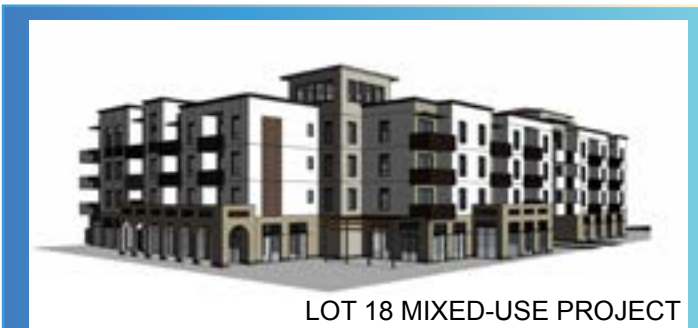
LOT 18 MIXED-USE PROJECT

GF Properties Mixed-Use project on Lot 18 will soon start construction on 66 apartments, underground parking and 10,563 sq. ft. of retail. Block 18 is located at Mission Avenue and Cleveland St.