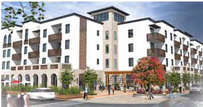
Artist rendering of GF Properties - Lot 18