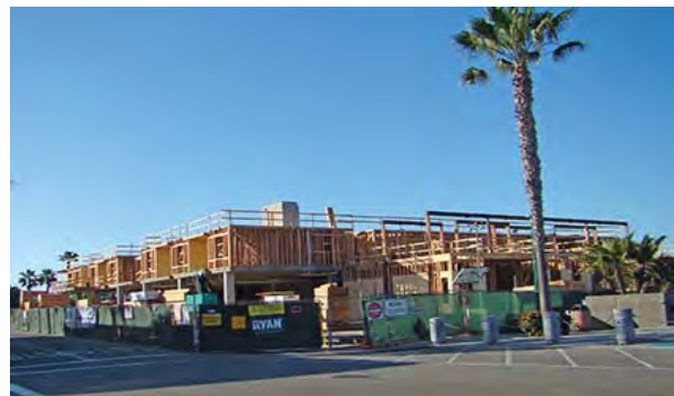
Construction of GF Properties - Lot 18

GF Properties - Block 18 in downtown Oceanside is constructing the second floor of their mixed-use project. The project consists of 66 apartments, underground parking and 9,500 sq. ft. of retail. Block 18 is located at Mission Ave. and Cleveland St.