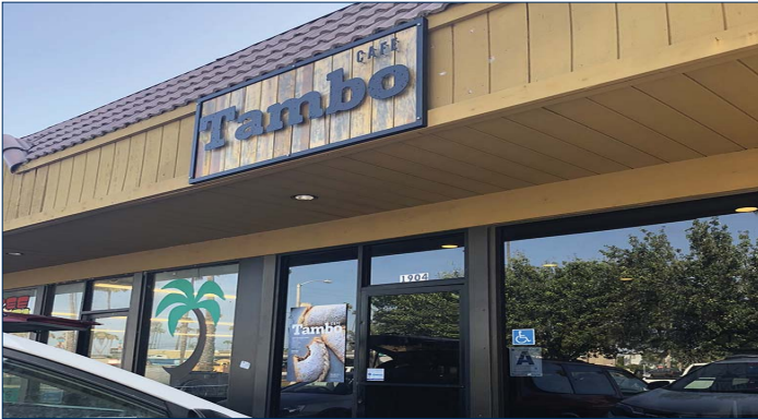
Tambo Cafe is now open at 1904 South Coast Hwy. Tambo offers Peruvian delights such as tamales, “sanguches” (sandwiches), pastries and drinks.