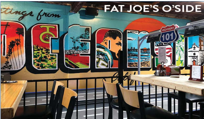
Fat Joe's O'side is now open at 424 S Coast Hwy. Fat Joe's is a family friendly restaurant and arcade that serves burgers, pizza, wings to name a few. They have classic 80's arcade video games, pinball machines, air hockey and a two lane mini bowling lanes.