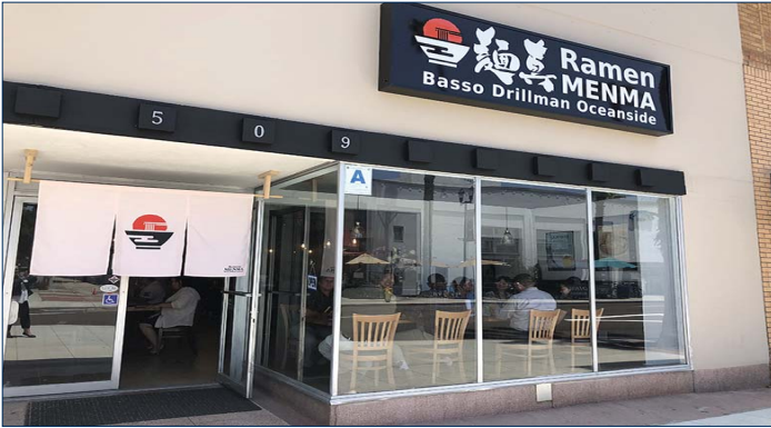
Ramen Memna is now open at 502 Mission Ave. in Downtown Oceanside.