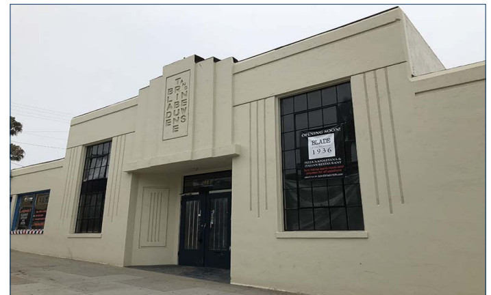
Coming this fall “ Blade 1936 ” a modern Italian eatery will be located at 401 Seagaze in downtown Oceanside. This restaurant's name is a tribute to The Blade-Tribune, a local newspaper that resided in the building from 1936 until the 1960s. This historic building was architect Irving Gill's last project and is being revived by local architect Kenneth Chriss.