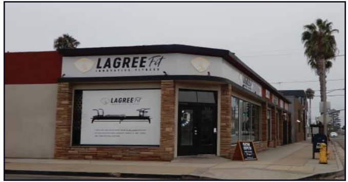
Lagree Fit is now open at 515 Vista Way in South Oceanside.