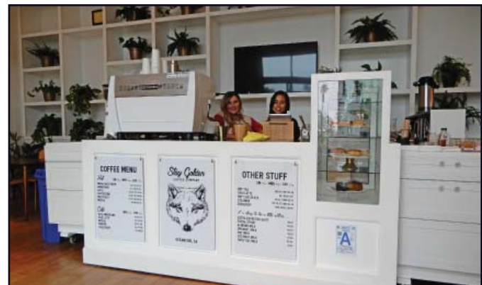
Stay Golden Coffee Company is now open at 110 North Myers St. in the lobby of Oceanside Springhill Suites Hotel.