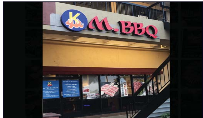
M. BBQ is now open at 2216 South El Camino Real in the North County Place shopping center.