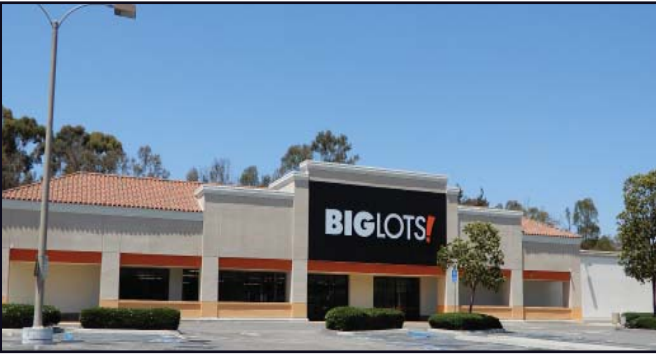
Big Lots located at 1702 Oceanside Blvd. in Best Plaza will have their grand opening on Friday, October 5.