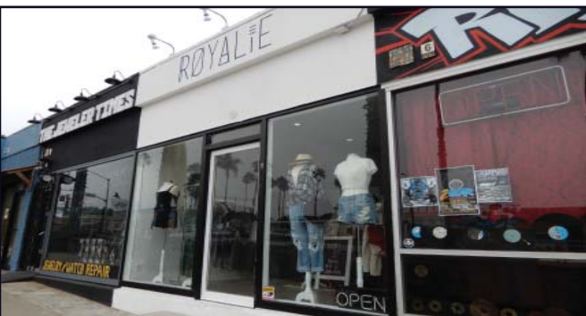
Royalie has relocated to 403 Wisconsin Ave., #F. Royalie sells the latest in bohemian chic clothing.