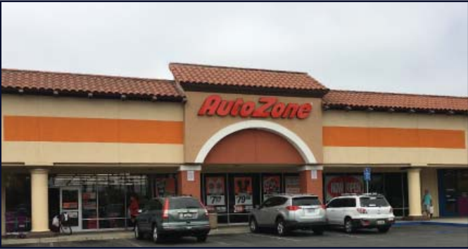
Auto Zone has relocated to 1028 Mission Ave. in the Mission Square shopping center.