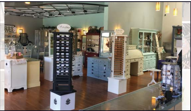
Eclectic Vintage Design has relocated to 4259 Oceanside Blvd. in the Oceanside Marketplace shopping center and sells new home decor, gifts, jewelry and upcycled, refinished furniture.