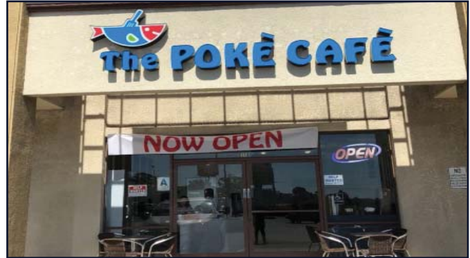
The Poke Cafe is now open at 3910 Vista Way adjacent to the Home Depot.